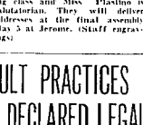
CULT PRACTICES DECLARED LEGAL

SAINT LAKE CITY, April 26 (AP)—A court decision today declared that cult practices are legal, a decision that was a victory for the members of the Jonestown cult.