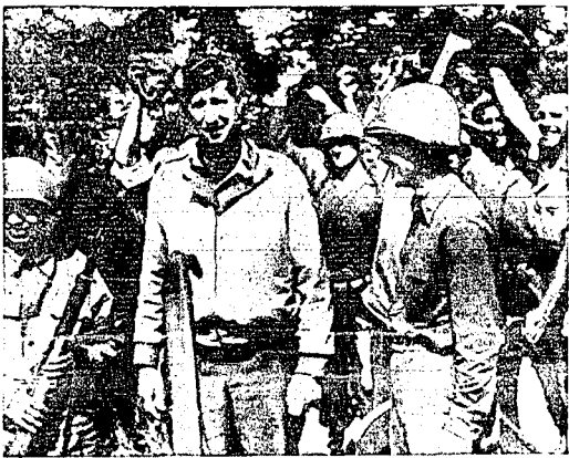
Cheering American and British troops crowd around Gen. Mark Clark to celebrate long-awaited junction of beachhead and main fifth army troops in Italy.

Issues involved in the case may be raised for months, but the board set up a committee of five to study the company's Chicago machinery, the board set up a committee of five to study the company's Chicago machinery.