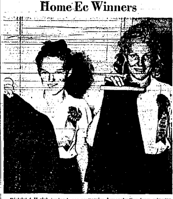
Home Ec Winners