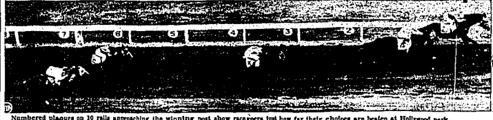
Numbered players on 10 balls approaching the winning post show racers just how far their choices are beaten at Hollywood park.