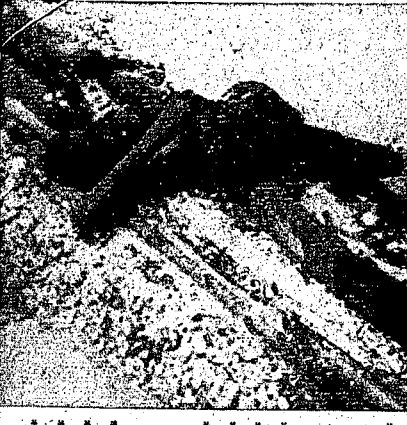
Wreckage of two sections of the Northern Pacific's creek westbound Pacific Limited was scattered about the Idaho Sunday.