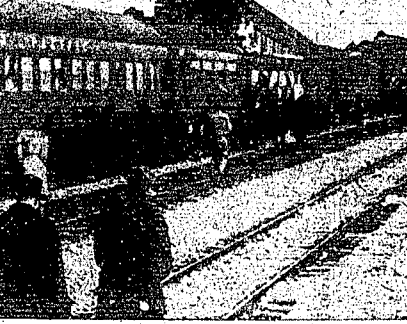
Two planes: Wreckage of two sections of the Northern Pacific's creek westbound Pacific Limited was scattered about the Idaho Sunday.

The wreckage of two sections of the Northern Pacific's creek westbound Pacific Limited was scattered about the Idaho Sunday.