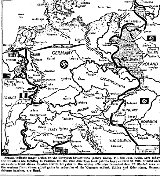
Arrows indicate major action on the European battlefronts (heavy lines). On the east, Berlin says today, the Russians are fighting in Foman. On the west, American tank patrols have entered St. Vith...