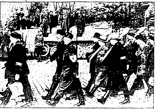
Rushed to the eastern front and given "complete peace" to rally German strength against the Russian escapee Adolf Hitler's Führer (center, wearing stand) retires Volksturm (front guard) units during celebration in Poznan, Poland.