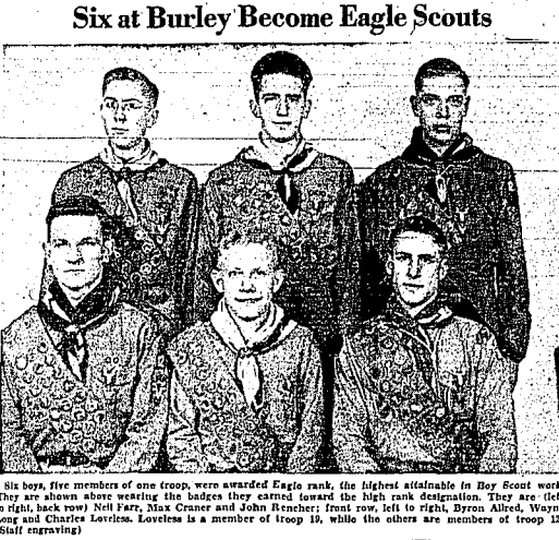
Six boys, five members of one troop, were awarded Eagle rank, the highest attainable in Boy Scout work...

WANTED - Live Poultry HIGHEST CASH PRICES HOLMES PRODUCE 205-221 4th St., Phone 917-W