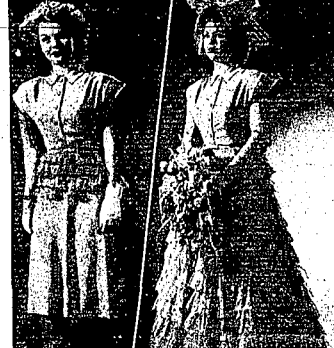
Practical-minded brides and bridegrooms, who want to wear their wedding finery long after the rice and odd shoes have been swept away, will welcome the new collection of gowns with a future directed for a recent bridal clinic fashion show. Pictured above is one of the most effective of these dual-purpose gowns. When the skirt of fluffy gray net is folded up, it reveals the street-length gray crepe dress with a decorative four-tiered petal at the top.