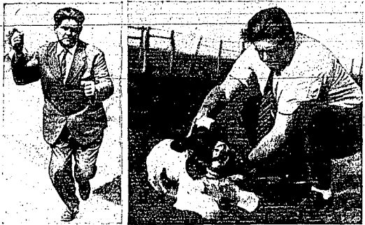
Firpo, 21 years out of the ring, looks healthier than ever. The "Wild Bull of the Pampas" is doing all right these days with his cattle ranches, to which he devotes much of his time.