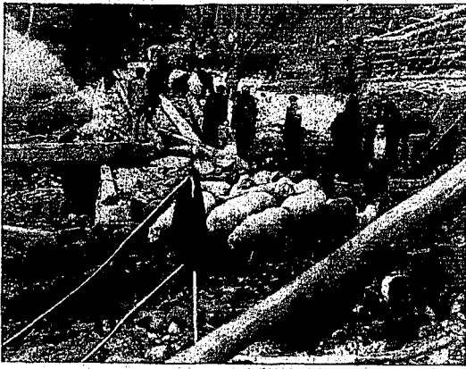
Upper plotter: A small herd of sheep (look like our Idaho sheep, eh?) rook by as Italians, working the soil in a field near the Rhine. When the Nazis moved into the Rhine, they immediately set to work rebuilding the western frontiers — and with civilian German labor, Eger and Willing, the Germans ranging in age from 14 to 70, were put to work rebuilding roads, as shown above, operating sawmills, and working in the steel mills of the Ruhr.