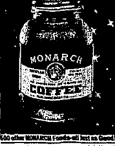
See other MONARCH products on our counter.

JEROME, Feb. 20—Sponsored by the men's fellowship group of the Methodist church, there will be father-son banquet served by women of the W. C. C. Wednesday evening, Feb. 21.