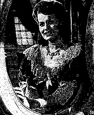
Maureen O'Hara makes a pretty picture as she poses in a picture.