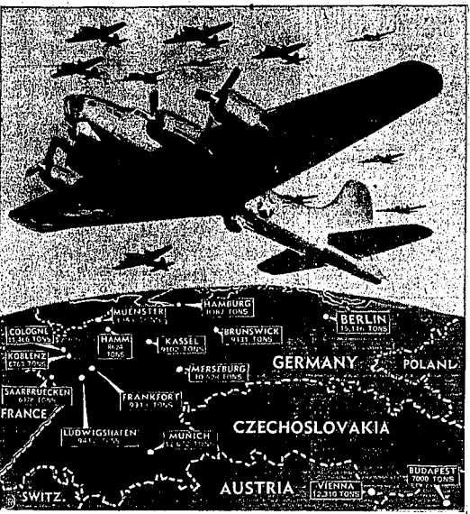
Map above shows tonnage of bombs dropped on Germany by U. S. army air forces in the past 11 months. Berlin, which the war department declares "the most heavily bombed target in Europe," got 15,116 tons...