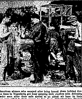
American airmen who escaped after being forced down behind German lines in Yugoslavia get busy spraying their clothes with decontaminating powder soon after their safe arrival at an allied air base in Italy. They are aided in their escape by Gen. Draja Mihailovich's Chetnik guerrillas.