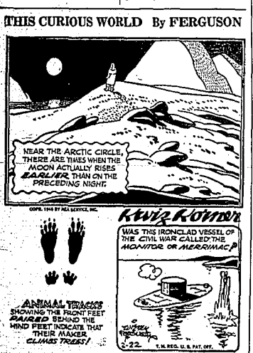
Advertis: The Union ship, the Monitor.

THIS CURIOUS WORLD By FERGUSON NEAR THE ARCTIC CIRCLE THERE ARE TIMES WHEN THE MOON ACTUALLY RISES EARLIER THAN ON THE PRECEDING NIGHT. ANIMAL TRACKS SHOWING THE FRONT FEET FIRST BEHIND THE REAR FEET INDICATE THAT THEIR MAKER THAT WAS ALWAYS HUNTING TOWARD THE REAR OF THE ROOM.