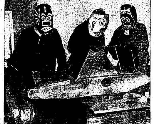
But you don't need to be afraid that "the goblins" get you if you don't watch out! although they're wicked-looking fellows. This is just a sample of the correct thing in men's wear at Boise—that is, in some men's wear, the most in the plant of the Olcott manufacturing company, which is turning out tailors for army engineers. Never mind who they are, 'tilt is 'tilt,' because in this case identity is lost.