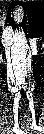
This army and navy, blasted stomach, and haunting fear in the eyes of this Filipino girl eloquently testify to the privation suffered under Jap rule. She holds mess can ready for U. S. army rations.