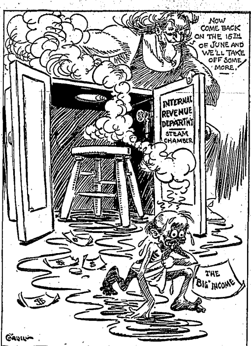
THE BIG INCOME