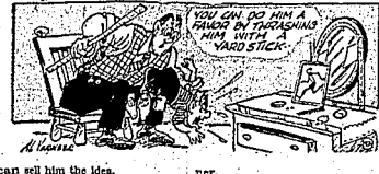
YOU CAN DO THIS! If you do this you will have a pair of strong feet. You can do this by thrashing him daily.

By AL VERMEER NEA Staff Correspondent NEW YORK, March 14.—Qunder Haegg hopes you will like it in the proper sense when he says he has strong feet. They are physically strong feet. He takes exercise out of them, and he is a runner. The average American can also possess sound legs if he will only give them a little care and consideration. Too many people pull a chair over their feet and then proceed to forget them from any other part of the body.