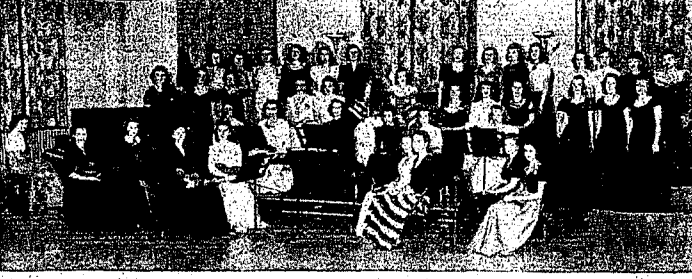
Here are the members of the University of Idaho all-girl singing orchestra who will appear in concert Tuesday, April 17, at the Twin Falls high school building...