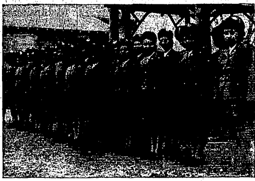
Indian student nurses live at Sago Memorial hospital, Ganado, Ariz., which operates the only accredited United States nursing school for Indians.