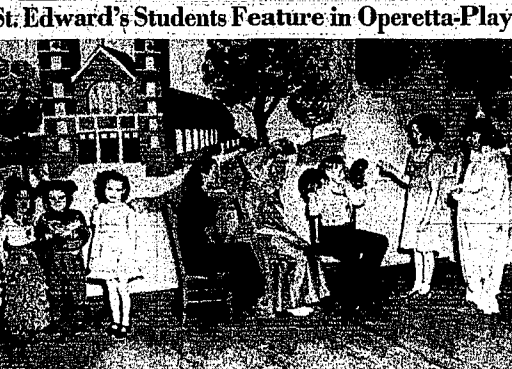
St. Edward's Students Feature in Operetta-Play

Motorists Now Get Extra Gas Mileage "Thousands of motorists, taxicab, truck and tractor owners are now getting up to 30% extra gas mileage, more power and pick-up, more economy and a quicker starting and running on their cars, with the new improved, Vacuum-type carburetor on their cars. "Breaths" automatically and can be installed by anyone in a few minutes. It is made in Twin Falls, Idaho, U.S.A. Price $12.50. Write to: Vacuum Carburetor Co., 7011-4th State St., Warrenton, Ore. We are offering a Vacuum-type carburetor to anyone who will make us his name and help introduce it to others. They will gladly send full price particulars and will give you a special name and address on a penny post card today.