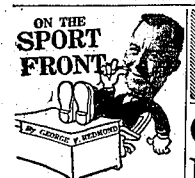
ON THE SPORT FRONT