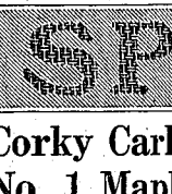
ON THE SPORT FRONT