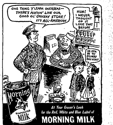
ONE THING Y' LEARN OVERSEAS—THERE'S NOTHIN' LIKE OUR GOOD OLD GROCERY STORE! IT'S ALL-AMERICAN!