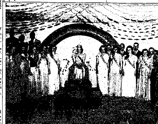
Twelve wards gathered at Carey recently for the stake annual ball.