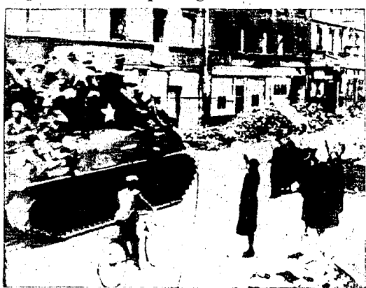
Children stand in the rubble-filled streets of Munich to give greetings to tanks of the seventh army which captured the city. Visible are traces of allied bombing of the city, several ground control towers.