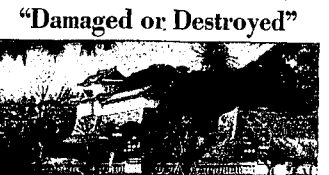
This is the palace of Emperor Hirohito, relating the splendor and the fire which it has seen. The palace was not made clear. Premier Kantaro Suzuki was quoted three different ways that the palace was destroyed, that it was burned, but it was destroyed.