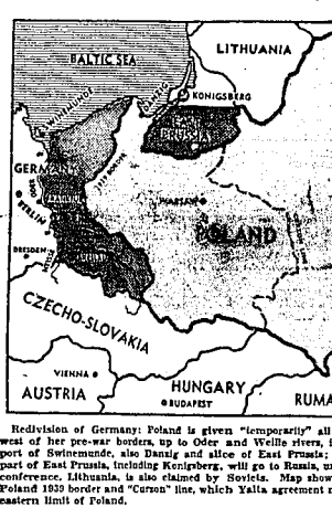
Redivision of Germany: Poland is given "Wuppertal" all territory west of present border up to West and Welle streets, important part of East Prussia, including Konigsberg, will go to Russia, until peace conference. Lithuania is also claimed by Soviet. Map shows German Poland 1939 border and "Gersun" line, which Yalta agreement made new eastern limit of Poland.