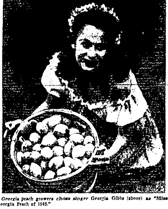
Georgia peach grows chose singer Georgia Gibbs (above) as 'Miss Georgia Peach of 1945'.