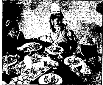
Circus party for seven- and eight-year-olds.