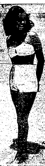
Something new in bathing suit fashion was exhibited by county. The Matheus of St. Petersburg, Fla., recently when she appeared on the beach in a swim suit fashioned of fish net material lined with white jersey—as pictured above.