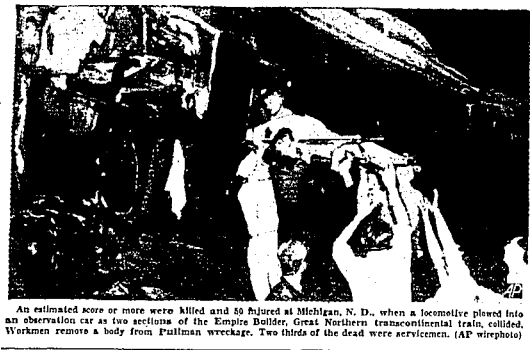
An estimated score or more were killed and 50 injured at Michigan, N. D., when a locomotive plunged into an embankment on the Empire Builder, Great Northern.

Workers remove a body from Pullman wreckage. Two thirds of the dead were servicemen.