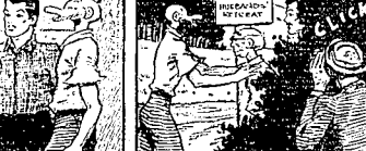
By GUS EDSON

GASOLINE ALLEY CHIPPER IS GETTING TO BE A BIG BOY. SEE HOW HE CAN SUPPORT HIS HEAD! IT'S GETTING END, HE'S OLD! AND LOOK! HE CAN SWING A HEAVY KETTLE!