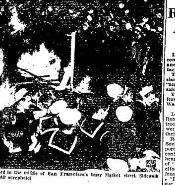
Celebrants will around a bonfire started in the middle of San Francisco's busy Market Street, sidewalk bonfire provided fuel for the fire.