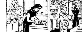
By McEVOY AND STRIEBEL

THE GUMPS DEAREST LITTLE MARIELLE: YOU CAN'T DISOBEY ME ANY LONGER! YOU OBEY ME AT YOUR SIDE— HEN PECK DON'T TELL ME YOUR WIFE IS BEING KEPT BY THE TRAIL! I WROTE HER A LETTER LAST WEEK TELLING HER I'M NOT SO FOND OF BEING KEPT BY THE TRAIL! YOU'VE GOT IT! THAT BAR EN?