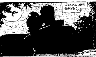
By EDGAR MARTIN

WASH TUBBS I'D BE HONORED TO HAVE YOU MILITARY SECURITY POLICE AS GUESTS AT MY BROADCAST—YOU CAN CONTINUE YOUR QUESTIONING LATER. VERY VERY WELL.