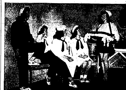
There were 150 present for the launching of the USS Youth staged at the membership dance at the Youth Center...