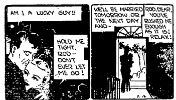
By EDGAR MARTIN

WASH TUBBS I'D BE HONORED TO HAVE YOU MILITARY SECURITY POLICE AS GUESTS AT MY BROADCAST—YOU CAN CONTINUE YOUR QUESTIONING LATER. VERY VERY WELL.