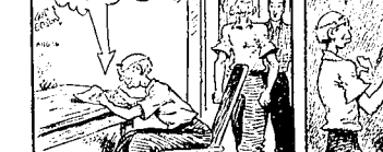
By GUS EDSON

GASOLINE ALLEY CHIPPER IS GETTING TO BE A BIG BOY. SEE HOW HE CAN SUPPORT HIS HEAD! IT'S GETTING END, HE'S OLD! AND LOOK! HE CAN SWING A HEAVY KETTLE!