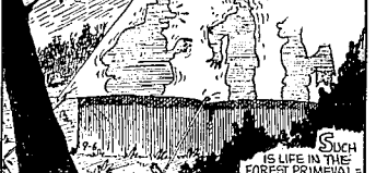
SUCH IS LIFE IN THE FOREST PRIMITIVE.

WOOD-GO-WOOD-GO! OH-ULP! GEE! TO BE CASAB! WHAT BLOOD-CURDLING SOUND IS THAT? SASSON! ANY SHOTGUN AND BARGE ON TO MAKE HASTE! THAT MAN ONLY CROAKING POLITY INSTANT MAJOR, BUT IF IT RAIN HERE'S WHERE STAY! THE A MARATHON RUN FROM THE VESSEL'S LANDSCAPE! OH SHIT! UP! TAKE A DEEP BREATH! TO GET UP AND GO! HERE'S GOOD! THE HOT-ONLY WITH A RY SHOOTER!