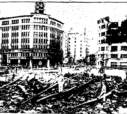
Two Americans look over debris in the Ginza district of Tokyo during a tour of the city August 31. This is Tokyo's main shopping center.