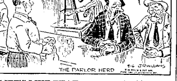
THE PARLOR HERD

"I KNOW BUT I'D LIKE TO BE SURE IS THIS ONE FOR SALE?" "TOLD YOU THEM HORNS. MEASURE SIX FOOT FOUR AN' ONE EIGHTH STAINLESS STEEL ACROSS!" "PURE WES! A FELLER SOLD HIM THE LONGEST HORNS IN THE WEST AND HE'S FINDIN' ONE'S BETTER THAN ONE'S!" "HE BETTER NOT ASK ME TO HELP HAND THEM! I'LL HANDLE 'EM! THE CORN-STUFFED ONES! HE'S BUT SAWDUST STUFFED-NEVER!"