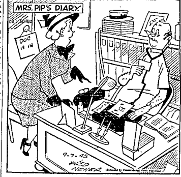
"You've made such great strides in medical science, Doctor, that I'm almost ashamed to tell you my same old symptoms."