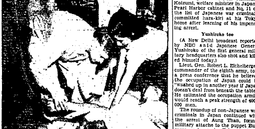
Capt. James Johnson, first cavalry division sergeant takes the pulse of Japan's ex-president Hedeki Tojo after the war had attempted suicide.

WASHINGTON, Sept. 14 (AP)—With three out of four men in the army already assured of release by July 1, military leaders held out the possibility today of a still faster demobilization speed-up.