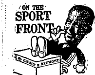
Some things Ye Olde Sport Screener didn't know about...