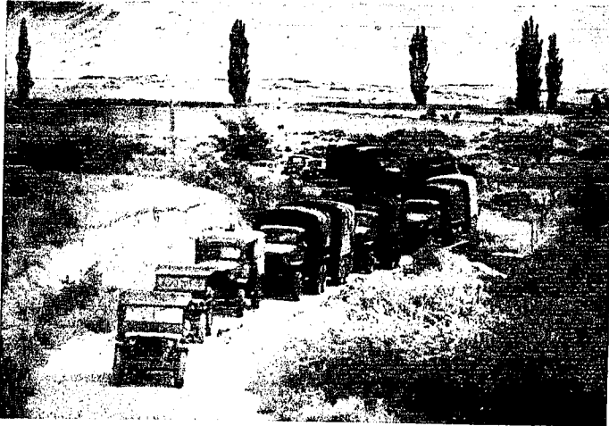
Here's the appearance presented by the convoy of the third battalion, Idaho state guard, on the work-end maneuvers and battle problem at the Bichel ranch, near the Hagerman fish hatchery. The army vehicles, pictured against the north side landscape, give you a faint idea of what might have been necessary if the Japs had landed parachute troops in Idaho, a not improbable occurrence at the start of the war and one for which an active defense was planned.

CONVOY