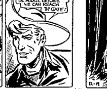
By FRED HARMAN