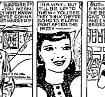
By V. T. HAMLIN