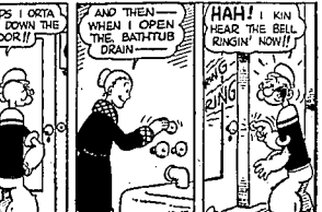
By EDMOND GOOD