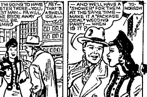
By V. T. HAMLIN