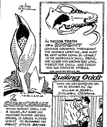
By EDMOND GOOD