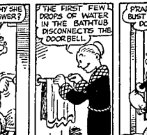
By EDMOND GOOD