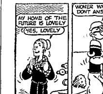
By EDMOND GOOD