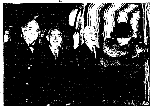
Four of the delegates to the United Nations general assembly leave from New York on the Queen Elizabeth (left to right) Sen. Tom Connally of Texas; Sen. Arthur H. Vandenberg of Michigan; Edward R. Stettin, Jr., permanent member of the security council of the warily council of the United Nations; and Mr. Franklin D. Roosevelt, other delegate to Secretary of State James F. Byrnes.