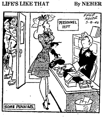
"I came in answer to your ad for a girl with a following."