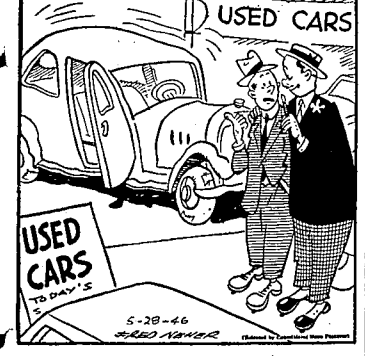
"Tell me again all you said about this car when you sold it to me last week . . . I'm getting discouraged!"