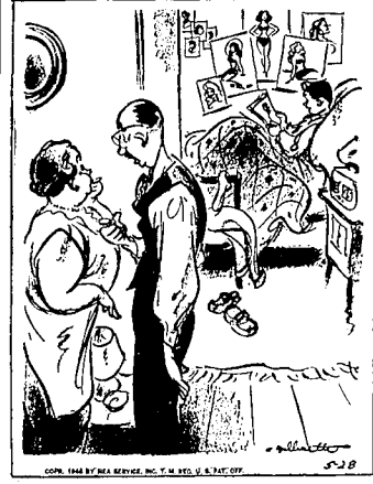
"Yes, but whenever I start to talk to him about the things in life that really count, he grins and says, 'I'm way ahead of you, Pop,'—and I get embarrassed!"