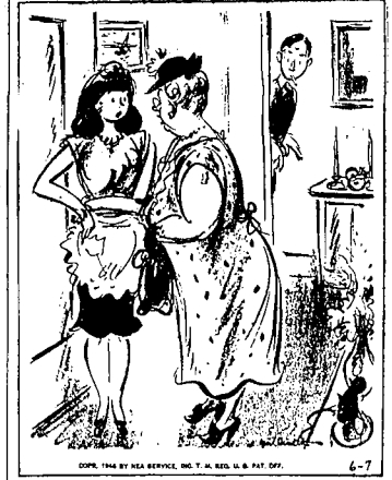
"I'm glad you're so happy, dear—and I hope you have let him know that being a husband isn't like the soft, easy life he had in the army!"