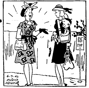
"I'm so thrilled . . . It's the first thing I ever earned with my own tears!"