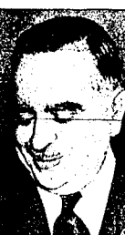
Jesus T. Pintero, above, Puerto Rico's first elected representative in congress, was scheduled to be appointed governor of his native island. He would succeed Rexford G. Tugwell.

Many busy cities use the two-position motor for firemen, the men being on duty for 24 hours and off the next 24.