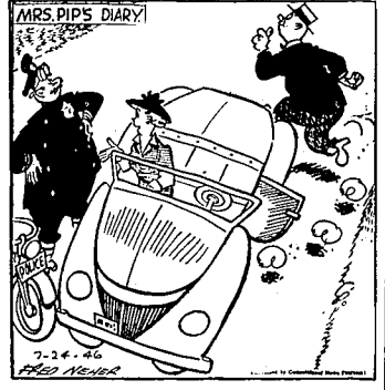
"He's running around once to change his luck."