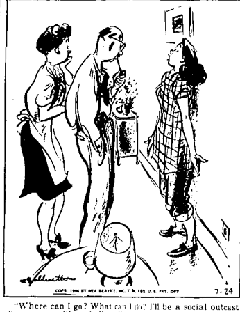
"Where can I go? What can I do? I'll be a social outcast all summer without ballet slippers."