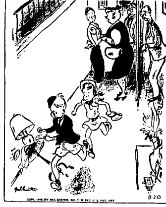
"We couldn't find a sitter, but we'd rather bring the children along anyway—we like to be watching them when they start to wreck something!"