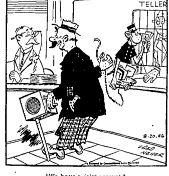
"We have a joint account."