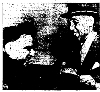
Florent H. LaGuardia (left) UNRRA director in Europe to survey famine conditions, smilingly accepts from U. S. Ambassador Laurence Steinhardt, a foaming glass of Pilsner beer, at Prague. A few moments later the former mayor of New York was scowling as he thought of the Czechs' plea for grain. Later he said he thought the nation would need no more U. S. grain.