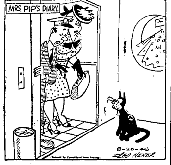
"Thirteenth floor! !"