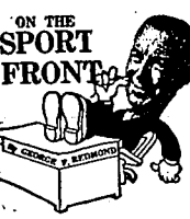
ON THE SPORT FRONT