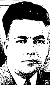
HAROLD B. LEE