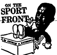
ON THE SPORT FRONT

With the following equipment to fit: 7 Foot Mower. Manure Loader, Factory built. Buck Rake. Heavy 4 row Corrugator. Power Saw. Power Winch.