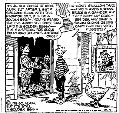
LIFE'S LIKE THAT