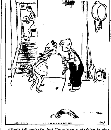
SIDE GLANCES By GALBRAITH