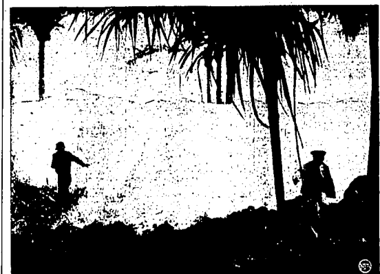
This huge wave smashing over the seawall near Hills-Falls, sends a fireman (left) and navy officer (right) scurrying for their lives over the rugged lava boulders.