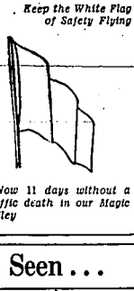
Now 11 days without a traffic death in our Magic Valley