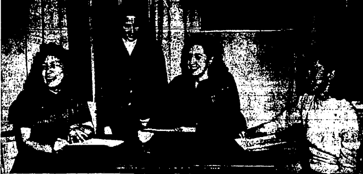
The joint annual meeting and world fellowship of the YWCA was held at the Christian church parlors Thursday evening...