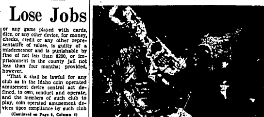
Police inspect wreckage of their headquarters at Haifa, Palestine, after bomb explosion that shattered building, killing four and injuring scores...