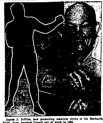
James J. Jeffries, now prominent amateur shows in his Burbank, Calif., barn, knocked himself out of work in 1904.