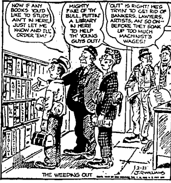
THE WEDDING'S OUT