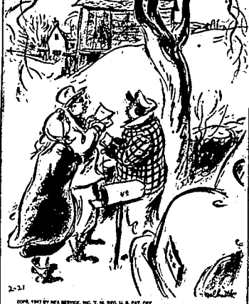
"Our son bought a new car so he could drive his wife and kids out west to see us, but he paid so much for the car that they can't afford the trip!"