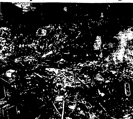
This is a general view of the wreckage of a building destroyed by a terrorist explosion in downtown Los Angeles. Three chemical experts blamed a compound of peroxide acid and acetic anhydride for the blast. (See story on page 12.) It was estimated that the 200 gallons of the mixture in a vat had an explosion heat of about 2,500 degrees.