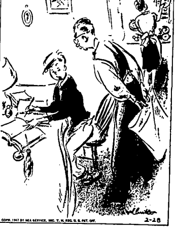
"I'm just taking a few ideas from Shakespeare for my English essay - it's like Robin Hood, stealing from the rich to help the poor!"