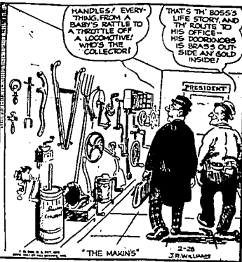
"THE MAKIN'S" 2-25