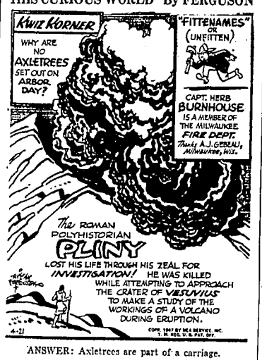
ANSWER: Axletrees are part of a carriage. By FRED HARMAN