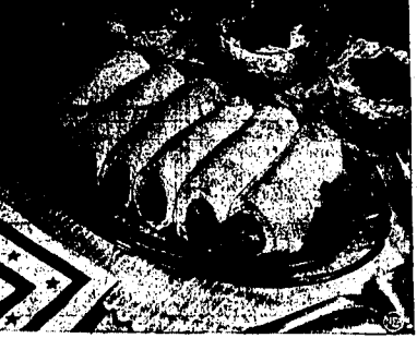
Perk up lagging appetites with stuffed frankfurters rolled in biscuit dough and served with cabbage salad.