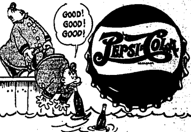
Pepsi-Cola Company, Long Island City, N. Y. Franchised Bottler, Pepsi-Cola Bottling Co., of Twin Falls