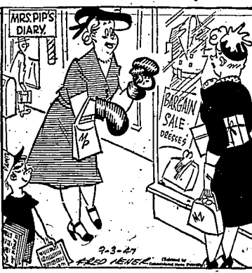
"My husband put them on me . . . So I can't get at my money everytime I see something I want to buy."