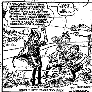
BORN THIRTY YEARS TOO SOON