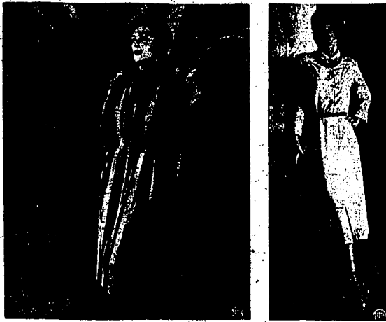
New details on classic-styled dresses for fall are the insatiable bias-cut leather belt on the black, rust and gray striped waist, left, and the easy-fitting classically waistband on the white wool knit, right. These touches make the new classics more feminine.

NEW YORK (NEA) — The girl who afraid that the end of bias dress is doomed to disappear in the new fashion shuffle can stop fretting. The classic dress has survived too many past fashion upheavals not to be able to buck this one, say designers. The classic stands strong, serene and slim in many high fashion collections. Often its silhouette and simplicity stand out as welcome relief in showings where over-stated fullness and repetitious whoop-de-do take the eye.